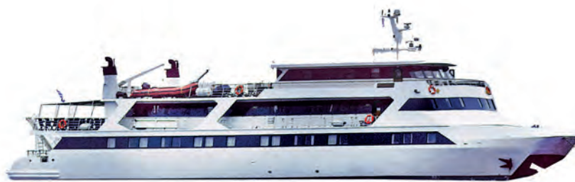
PEGASOS - 21 CABINS