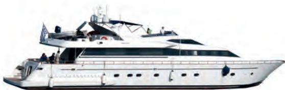
ABSOLUTE KING - 5 CABINS