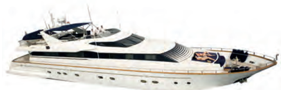
OBSESSION - 5 CABINS