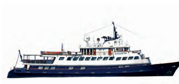
CALLISTO - 17 CABINS