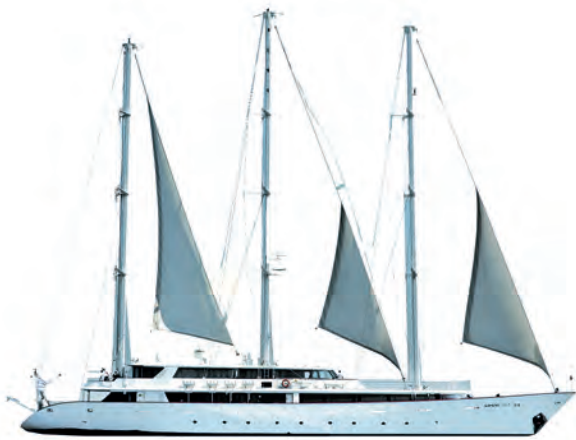
PANORAMA - 24 CABINS