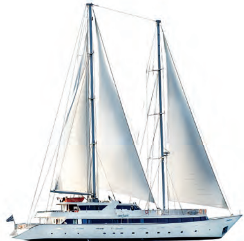
PANORAMA II - 25 CABINS