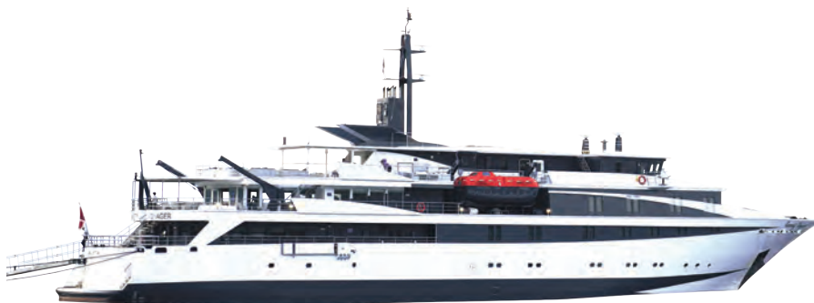
VARIETY VOYAGER - 36 CABINS