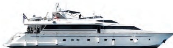
MONTE CARLO - 5 CABINS