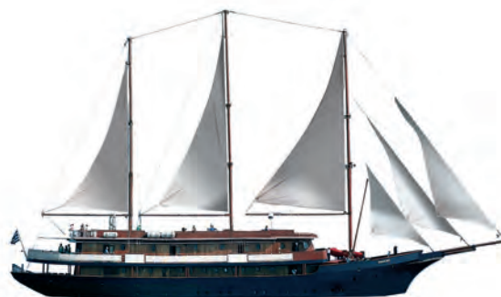
GALILEO - 24 CABINS