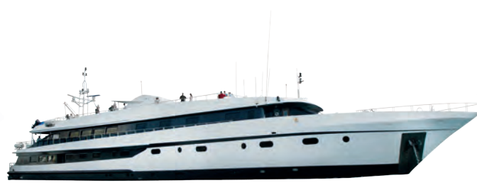
HARMONY G - 21 CABINS