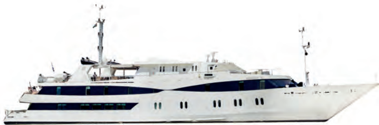
HARMONY V - 25 CABINS